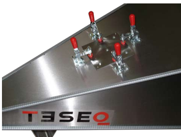
GTEM 250-SAE, view to the special opening