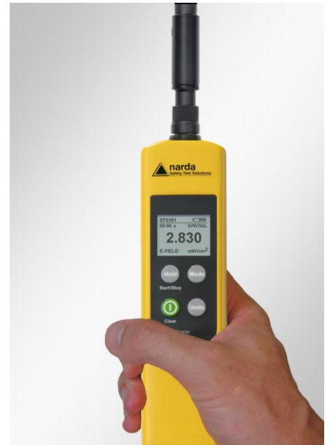
Small, lightweight and rugged design – ideal for use in rough environments