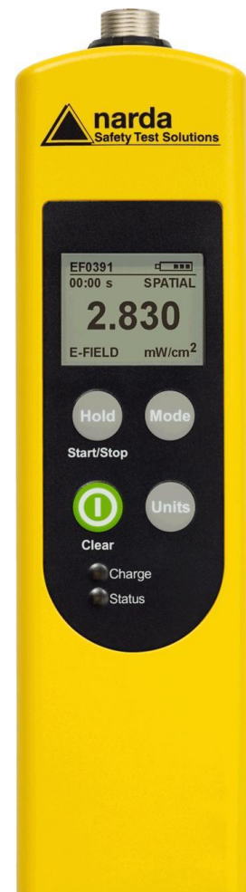
Narda Broadband Field Meter NBM-520

▲ Auto zero ensures precision measurements