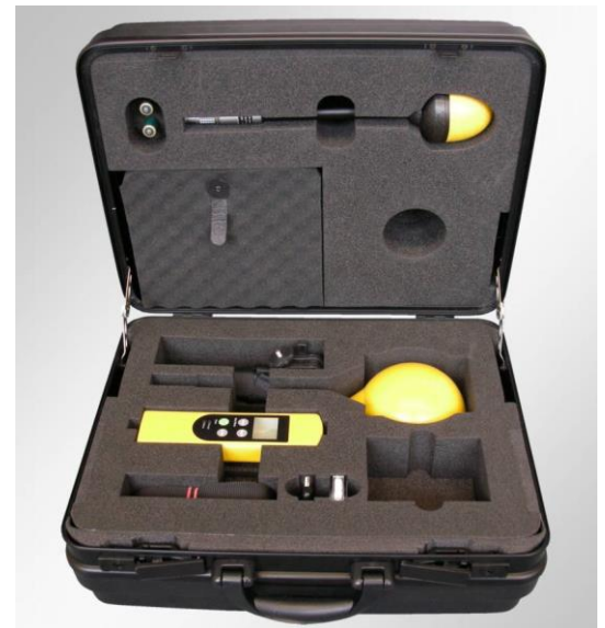
A rugged transport case is included. This provides ideal protection for the instrument, together with up to two probes and all accessories.