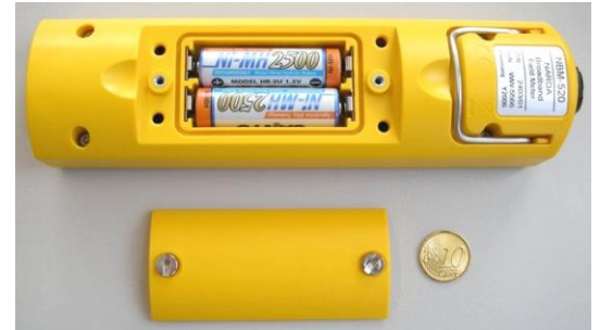
The battery compartment is opened easily using a coin. Two replaceable NiMH rechargeable batteries (AA size) are used to power the device.