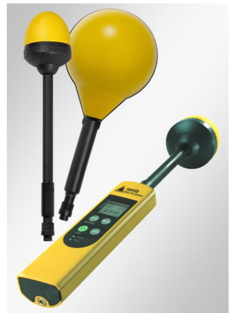
Changing the probe is quick and easy, with no need to reconfigure the device