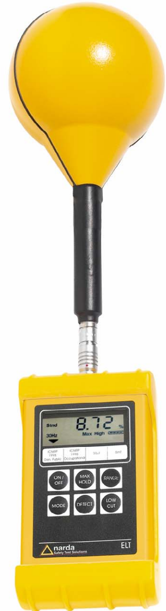
Exposure Level Tester ELT-400