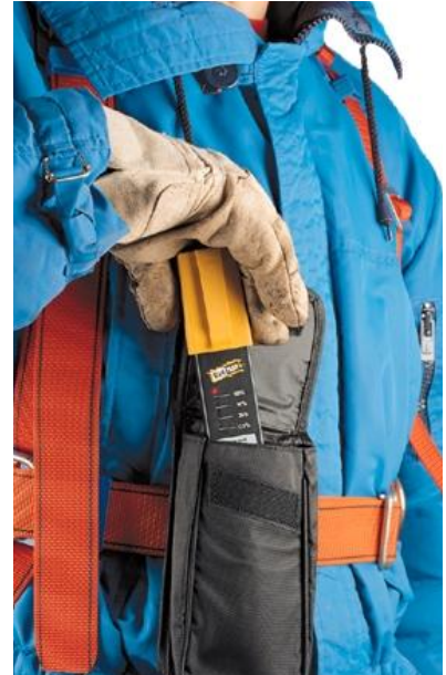
RadMan XT used as a personal monitor for radio frequency fields

As a locating unit all RadMan and RadMan XT versions can be used to locate leaks on waveguides and coaxial screw connectors (picture on the right). A non-conductive extension with handle is available as an optional accessory.