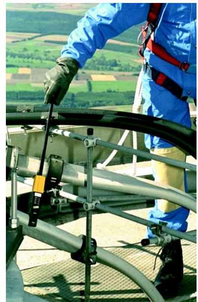
RadMan XT used as an instrument for leak detection