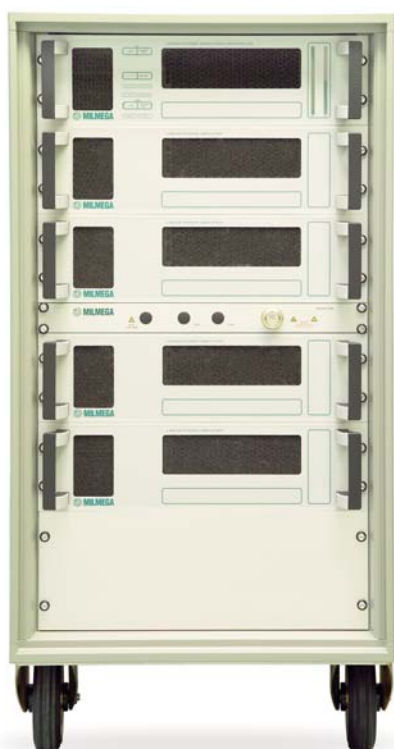
Unit shown mounted in a 20U wheeled rack case