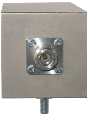
RSG 1000, view to the N connector