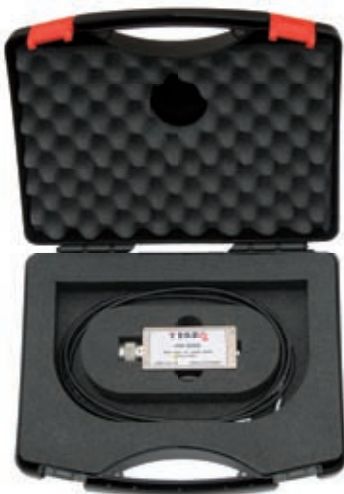
PMU 6006 in storage case